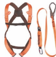
Fall Arrest Harnesses