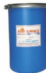
Water Gel Blanket