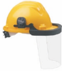
Safety Face Screens