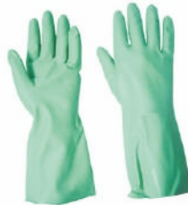
Nitrile Hand Gloves