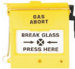
Manual Gas Abort Unit