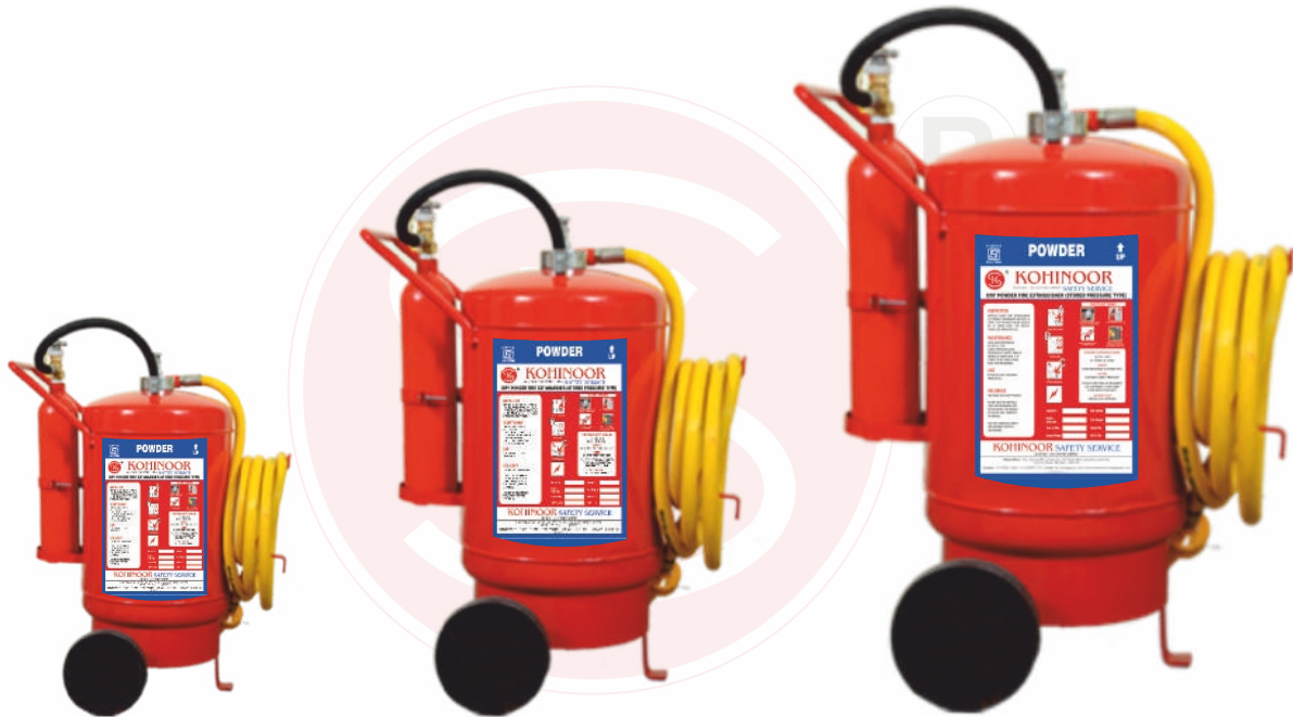
DCP 25 Kg

BC/ABC Higher Capacity Trolley Mounted Fire Extinguisher