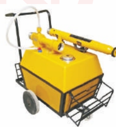
Mobile Foam Unit