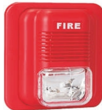
Hooter With Flash Light