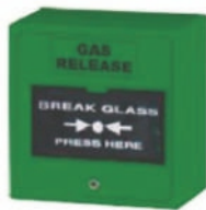
Manual Gas Release Unit