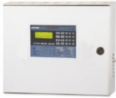
Addressable Fire Alarm Panel