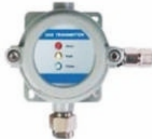
Gas Leakage Detector