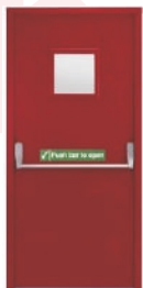
Fire Resistant Door