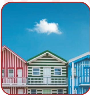
Houses & Apartments