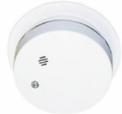
Battery Operated Smoke Alarm