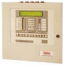
Fire Alarm Control Panel

Co./ Clean Agent / Water / Powder / Foam Bladder System