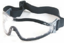
Splash Safety Goggle