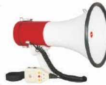
Megaphone PA system