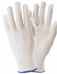
Cotton Hand Gloves