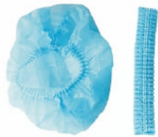
Head Cap (Bouffant Cap)