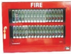
Conventional Fire Alarm Panel