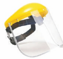
Safety Helmet with face shield