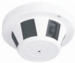
Panel Operated Smoke Alarm