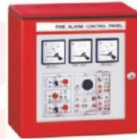
Electrical Control Panel For Fire Pump