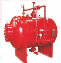
Foam Bladder Tank