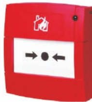
Manual Call Point